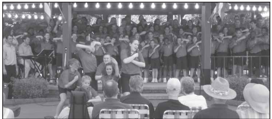
The Singing Angels entertained a large crowd at the Richmond Heights Community Park Gazebo this summer.

With the Board of Education approving the new schedule for the fall, new excitement generated by students, staff and administration will produce a building climate fertile for increased academic achievement.