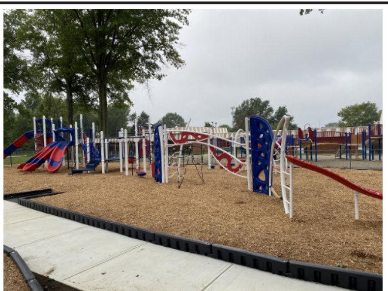
A section of the newly-constructed playground at the Richmond Heights Community Park. For more specific details, see Economic Development News last paragraph on page three of this Edition.