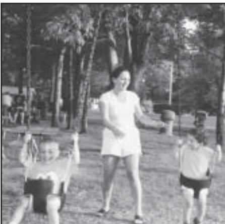
Fun activities at the park will be “swinging” into action soon.

For children 3 to 5 years old. Start learning the basics of soccer and have fun with our youth soccer staff. Bring a water bottle and get ready for the fun. The camp will take place at Richmond Heights Community Park. Time: 10:00 a.m. - 11:00 a.m./Fee: $25