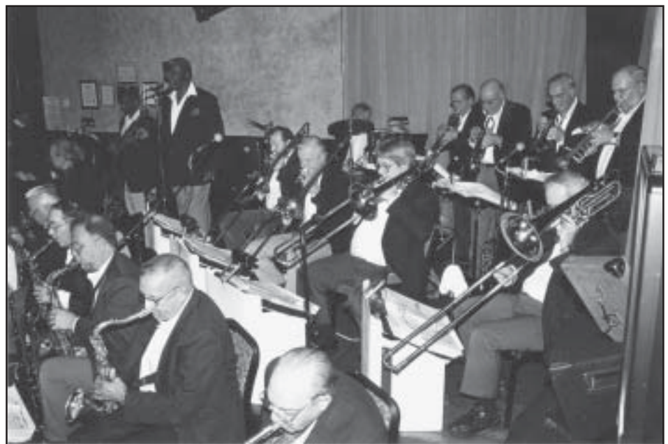
The 2004 Summer Concert Series will conclude on Wednesday, August 11 with The Swingtime Big Band performing. See page 12 for complete Summer Concert schedule.