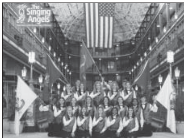
The Singing Angels will kick off the Summer Concert Series at Richmond Heights Community Park on Wednesday, June 23. (Sound equipment donated by Lentine's Music)

Have a safe, happy and enjoyable summer!