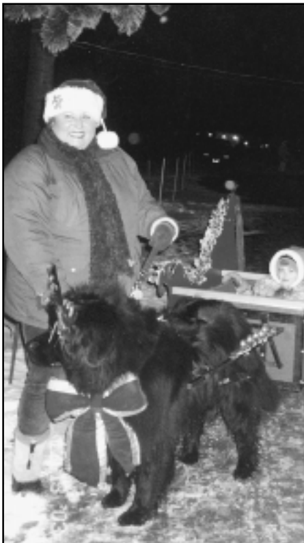
Santa's top reindeer Dino and friends at the December 12th Holiday Walk in the Park.