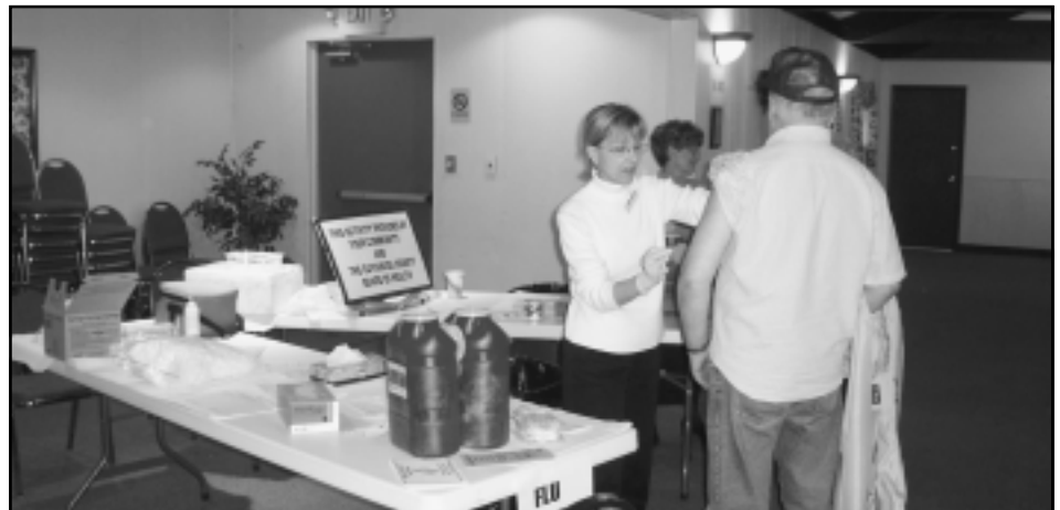
The volunteers did a wonderful job, and everything went smoothly during the flu shot program.

The Flu Shot Program was held November 6, 2003 at the Kiwanis Lodge. Close to 300 people participated but thanks to our volunteers, everything went very smoothly. In conjunction with the Flu Shot, a Resource Fair was held in the adjoining room and many providers from health care agencies, health care products, as well as nursing homes and assisted living facilities were represented. There were give-aways and valuable information for all. There was a surplus of "Vials of Life" that were handed out at the Flu Shot Program and Resource Fair and are available at City Hall to anyone who requests one.