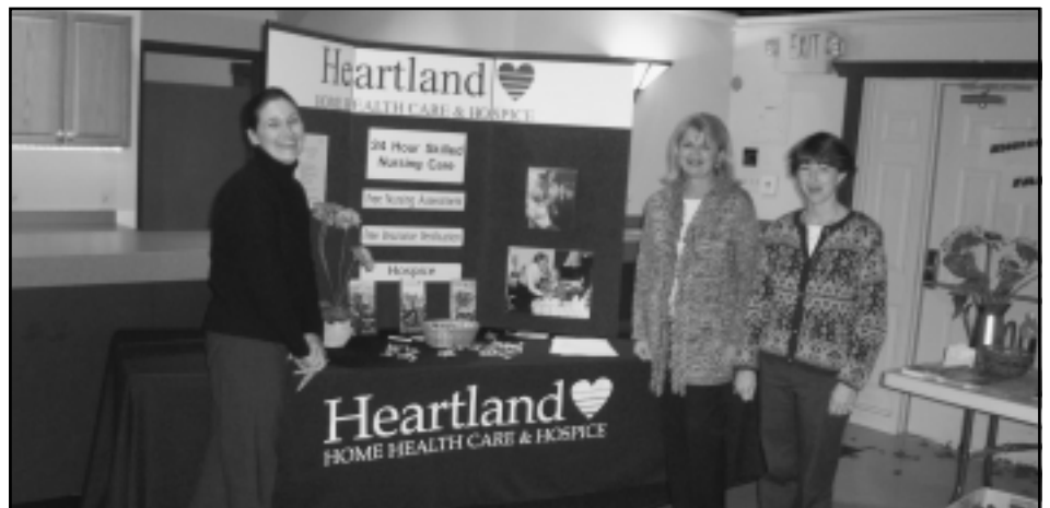
The Resource Fair was a great success and provided valuable information to our Senior Citizens.