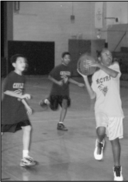
Richmond Heights Recreation Youth Basketball program has elevated to new heights this year with over 200 participants.