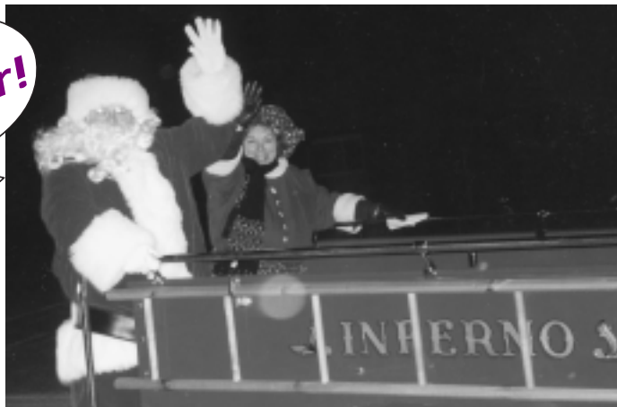
Santa & Mrs. Clause tour the City before the December 12th Holiday Walk in the Park.