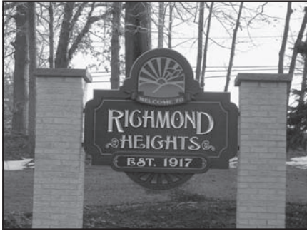
This decorative new monument sign is located at the top of Highland Road hill. This same design can be seen at major road City borders. The signs were installed last fall.