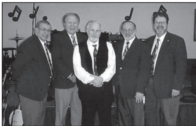
The Revue Band will be performing at the Kiwanis Lodge on April 5th.

Dances feature a live band and light refreshments are served. Dances are held on the first Wednesday of the month. Cost is $3 at the door. The Kiwanis Lodge is located at 27285 Highland Road in the back of Richmond Heights Community Park.