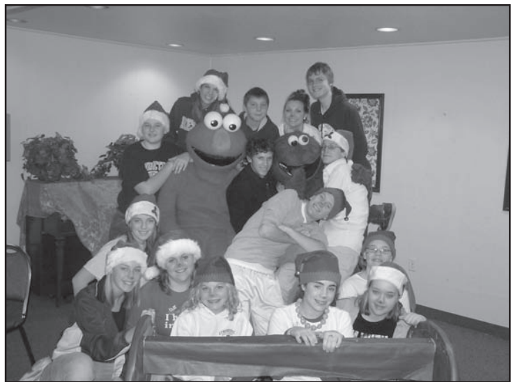
The Recreation Department would like to thank the pictured volunteers, as well the volunteers not pictured, for another wonderful Breakfast with Santa event.