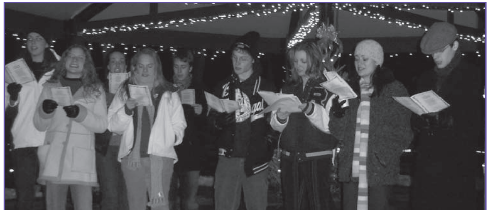
Carolers at the Holiday Walk in the Park on November 26.

Information provided by the Cuyaboga Soil & Water Conservation District with references provided by Ohio EPA's Headwater Habitat Initiative.