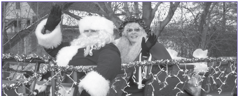
Santa and Mrs. Claus give a friendly wave on their route through the city.

For registration information, please call the Recreation Department at (216) 383-6313. Seating is on a first come basis.