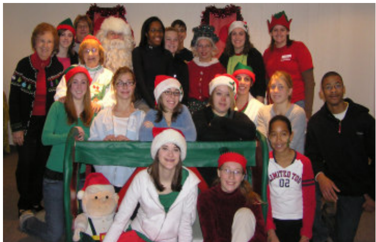
A special thank you to the volunteers pictured and those not pictured for their time and hardwork with the Recreation Department's Annual Breakfast with Santa event.