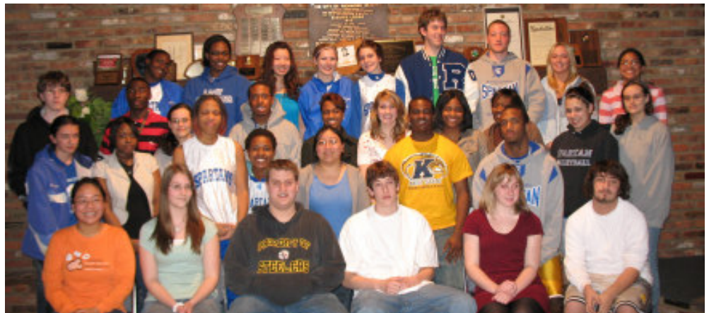
The Richmond Heights Key Club

One advantage of our Elementary School’s status as a school in “School Improvement” is our inclusion in the Ohio Improvement Planning process. At least once monthly, a team of teachers, administrators, counselors and community members led by representatives from the Ohio Department of Education meets to develop a plan to improve the delivery of instruction to our students. To date, the Team has identified areas in need of improvement and developed an action plan to be implemented by the entire staff.