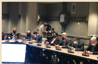
U.S. Conference of Mayors 90th Winter Meeting