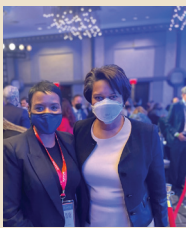
Mayor Thomas and Mayor Muriel Bowser District of Columbia, DC